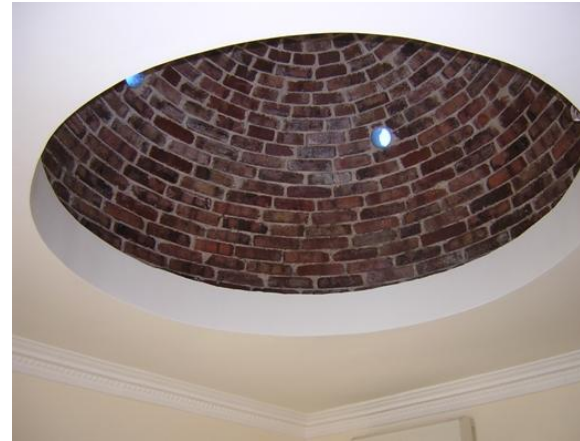
Maraqia Penthouse Dome 1