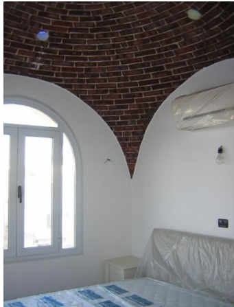
Maraqia Penthouse Bedroom 1