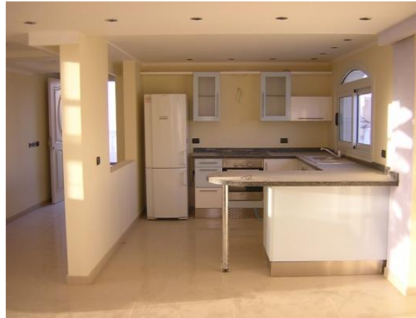
Maraqia Kitchen 1